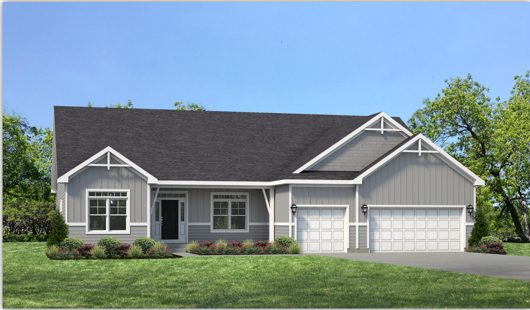
ELEVATION III OPTIONAL TRANSOM WINDOWS