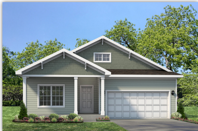
ELEVATION III OPTIONAL PAC CLAD ROOF