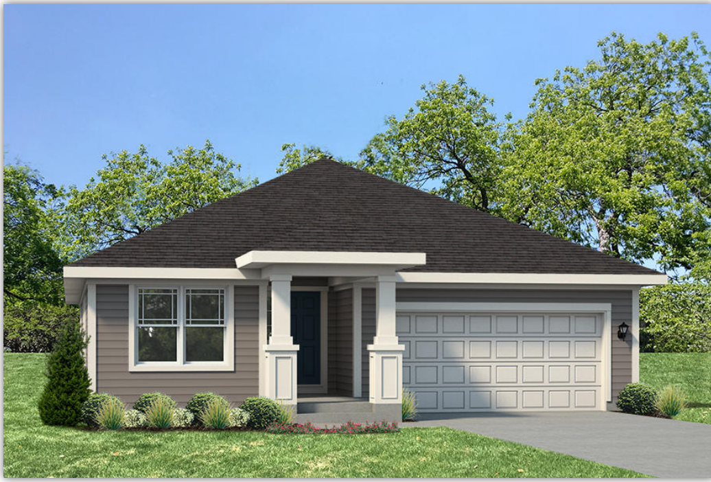
ELEVATION I OPTIONAL COLUMNS & OPTIONAL COLUMN BASES