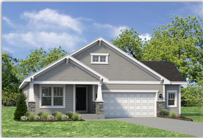
ELEVATION II OPTIONAL 2.5-CAR GARAGE, OPTIONAL STONE COLUMN BASES & OPTIONAL TAPERED COLUMNS