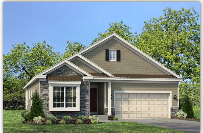
ELEVATION III OPTIONAL PAC CLAD ROOF & OPTIONAL STONE