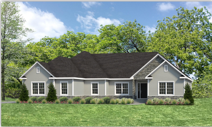
ELEVATION I OPTIONAL STONE