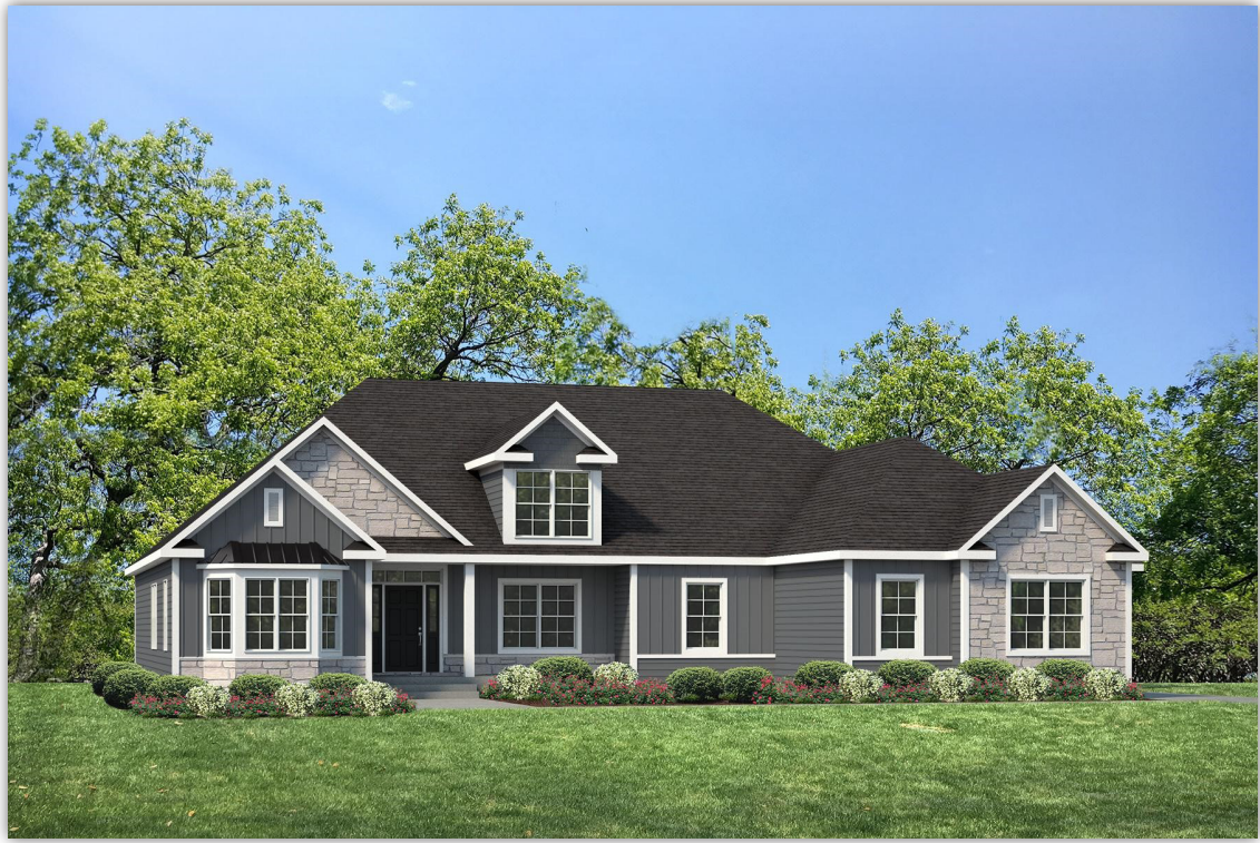
ELEVATION II OPTIONAL STONE, OPTIONAL BAY WINDOW, OPTIONAL PAC CLAD ROOF AND OPTIONAL DORMER