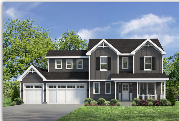
ELEVATION V - FOUR BEDROOM OPTIONAL PORCH RAILINGS, OPTIONAL 3-CAR GARAGE & GARAGE DOOR WITH WINDOWS