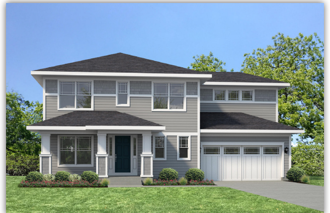
ELEVATION IV - FOUR BEDROOM OPTIONAL GARAGE DOOR WITH WINDOWS