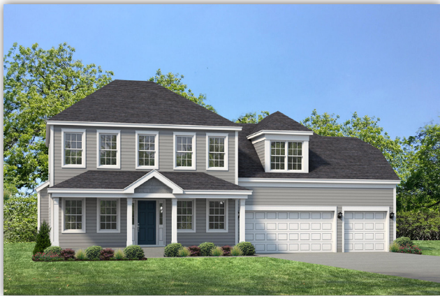
ELEVATION III OPTIONAL DORMER & OPTIONAL THREE-CAR GARAGE